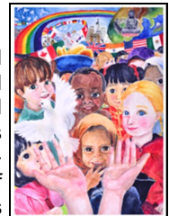
The Power of Peace" 2009-10 Grand Prize Win-

Each year, Lions clubs around the world proudly sponsor the Lions International Peace Poster Contest in local schools and youth groups. This Contest encourages young people worldwide to artistically express their visions of peace. The theme of the 2010-11 Peace Poster Contest is "Vision of Peace." Students, ages 11, 12 or 13 on November 15, are eligible to participate