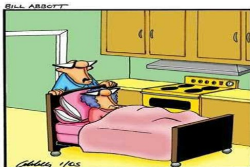
"I figured you should have breakfast in bed on your birthday. Can you reach the stove okay?"